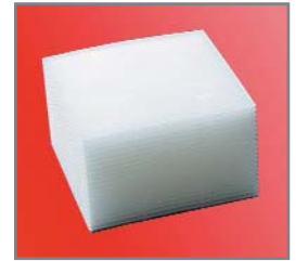
1 ft 3 module HD Q-PAC® Surface area: 132 ft 2 /ft 3 (432 m 2 /m 3 )