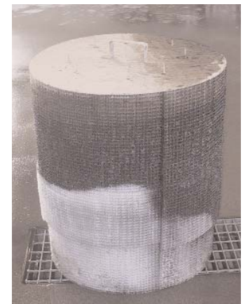
The cleaning of the HD Q-PAC® is shown (left) as well the result (right).