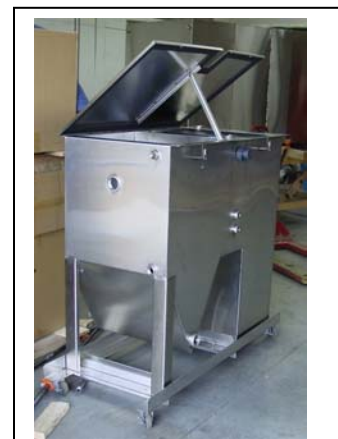
OWS unit – note sludge compartment with outlet at bottom of unit.

The oil removal efficiency of corrugated-sheet media can be improved by combining them with coalescing pads of fine plastic mesh. However, suspended solids can plug coalescing pads very quickly, so they have to be removed frequently for cleaning or replacement. The oil removal efficiency of HD Q-PAC ® is high enough so that coalescing pads are unnecessary, and consequently the OWS requires much less maintenance.