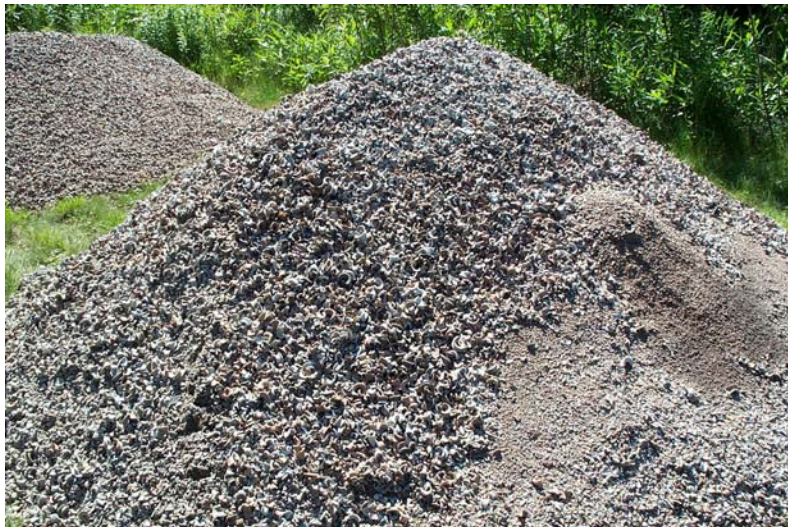
These saddles were removed from their RTO to allow for retrofit to MLM ® . Note some of the saddles had been ground to the consistency of sand. See case study www.lantecp.com/casestudy/casestudy36.html .

Note that several types of random media have been tried in this RTO, and have been preserved in the insulation.